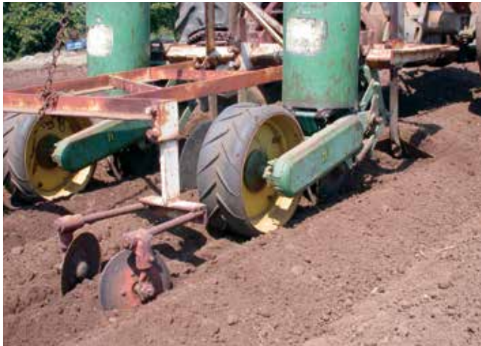
FIGURE 4. Disc hillers create a soil cap over the seed line.

In cooler coastal production areas you do not need to cap the seed lines. However, a very light soil cap (which does not need to be removed) helps keep the soil loose and moist. This can improve ease of emergence and stand uniformity in both extremes—when the soil is either slightly too wet or too dry.