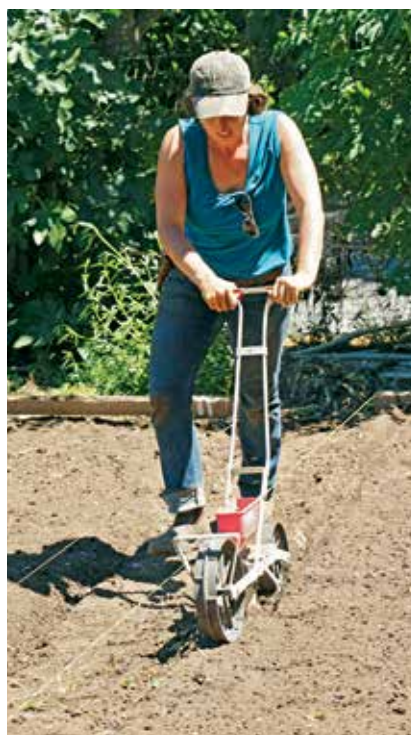
FIGURE 7. Push seeder.

Dry bean harvesting for direct market sales ($4–$6 per pound) can be easily and economically accomplished with minimal capital investment. The most common method used on the Central Coast to harvest small dry bean plots is to hand cut the entire plant when pods are mature (dry), but not yet shattering (Figure 8), and place them on tarps fully exposed to sun to allow them to continue to dry to the point of shatter.