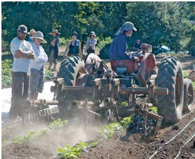
FIGURE 6. A rolling cultivator re-forms planting beds and “dirts” growing beans, burying the drip lines and any weeds.