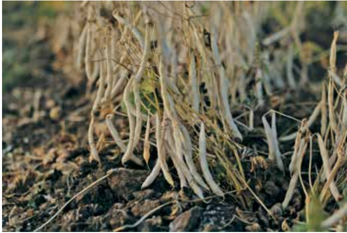
FIGURE 8. Dry beans ready for harvest.

Once the pods begin to shatter easily they can be “threshed” by either walking on them or by rolling over them with anything heavy enough to shatter the pod but not so heavy that it breaks the bean seed. Some growers on the Central Coast put the bean plants in burlap bags and drive over them with a light vehicle, such as small field utility “gator.”