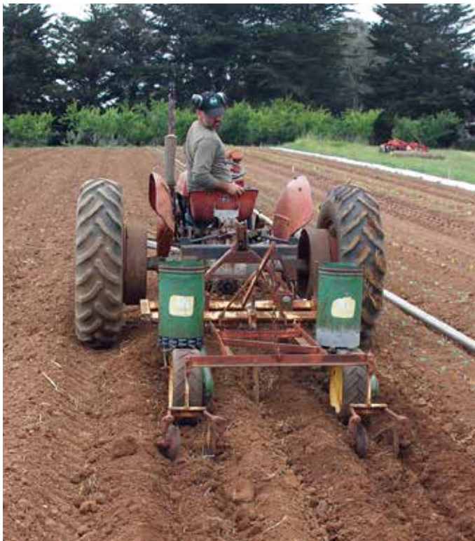
FIGURE 1. Planting bean seeds to moisture.

On soils with relatively good water holding capacity, large areas can be bedded, pre-irrigated, and then worked with a rolling cultivator following weed seed emergence. The cultivation will effectively hold soil moisture for 30 days or longer, allowing for successive plantings over time with minimal effort. To ensure harvest continuity for staggered plantings, plant the next round of beans when the prior planting is in the "crook" stage (see below), approximately every 10 days.