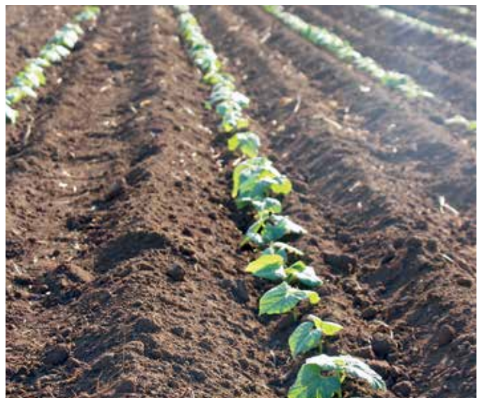
FIGURE 5. Newly emerged beans in trench.

As the beans continue to elongate, use a rolling cultivator for the second—and most effective—cultivation. Properly set, the cultivator will gently return the dirt that was pushed off the bed top at time of planting to the middle of the bed (Figure 6). The bed should end up looking just like it did prior to planting. If bean stems are long enough, this “dirting” cultivation will effectively cover both the drip line and smother any weeds that have emerged in the seed line while covering only the lower stem of the bean plant. This last cultivation, or “dirting,” leading up to harvest is commonly practiced on large acreages of many agronomic crops that are planted to moisture in situations where herbicides are not used. To perform this cultivation successfully requires specific and tightly adjusted implements, and a significant level of tractor skill. As small farms scale-up to mid-sized farms and larger acreages, planting to moisture and dirting can significantly reduce the labor required for weed control.