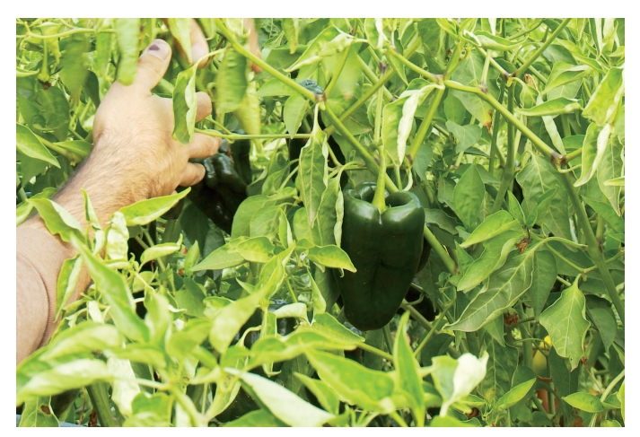
FIGURE 4. Gently move foliage aside to find ripe peppers for harvest.

Some growers support pepper plantings by placing stakes along the outside of the rows and running a single string line from stake to stake. This helps keep the plants upright and minimizes broken branches from both wind and heavy fruit set. The stakes are typically only as high as the pepper plant (+/-2').