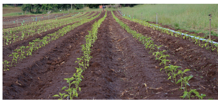
FIGURE 3. Initial overhead irrigation on pepper transplants helps establish plants.

Calculate irrigation amounts based on estimated evapotranspiration (Et) losses using local CIMIS station data (cimis.water.ca.gov) or other source. During the initial growth stages, multiply estimated Et losses by percent canopy. For