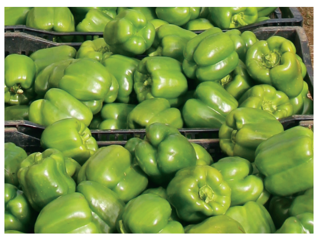
FIGURE 6. Bell peppers harvested for UCSC Dining, UCSC Farm.