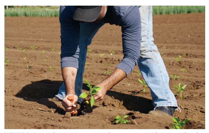
FIGURE 2. Deep planting ensures good root contact with moist soil and encourages adventitious rooting.