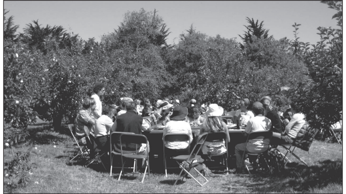
Participants at one of Sunday morning's networking sessions meet to exchange ideas.