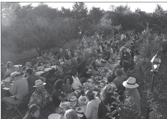
Celebrants enjoy dinner in the Farm's apple orchard as part of the Midsummer Night's Culinary Celebration.