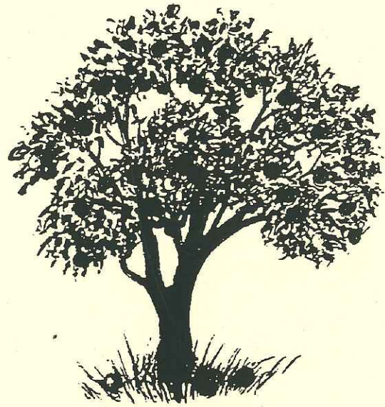
—Illustration by Margaret Bonaccorso

Knowing these climate factors will help you choose – or rule out – fruit trees for your garden. Many evergreen fruit trees such as avocado, citrus, and figs have tropical or subtropical origins and do not do well in areas with frosts. Pome fruits (apples and pears) need a certain amount of winter chill hours for optimal production. Some stone fruits (peaches, nectarines and apricots) need some winter chill but also require