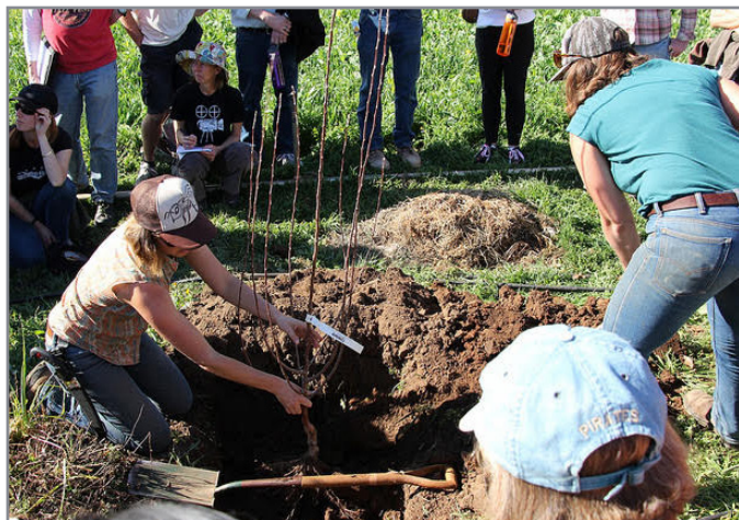
Farm staff demonstrate how to plant a bare root tree.

An even more aggressive or "over the top" approach to hole preparation could be entitled, "prepping the multi-year hole." This approach is time, labor and materials consumptive but has proved to work quite well over the years at the Alan Chadwick Garden at UC Santa Cruz.