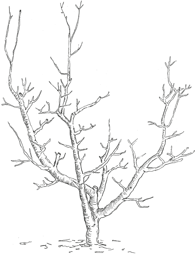
Open Center tree. Illustration by Noah Miska.