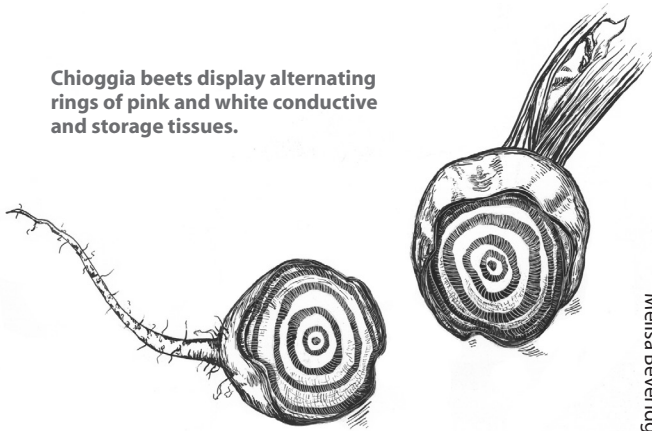
Chioggia beets display alternating rings of pink and white conductive and storage tissues.

Beets get their color from a group of pigments called anthocyanins. The specific pigment betacyanin contributes to red coloration. Golden and yellow varieties derive from betaxanthin. Betacyanin is neither heat nor water soluble, so it is not destroyed in the cooking process and will bleed red into soups and stews. The yellow betaxanthin is destroyed by cooking and thus doesn't stain.