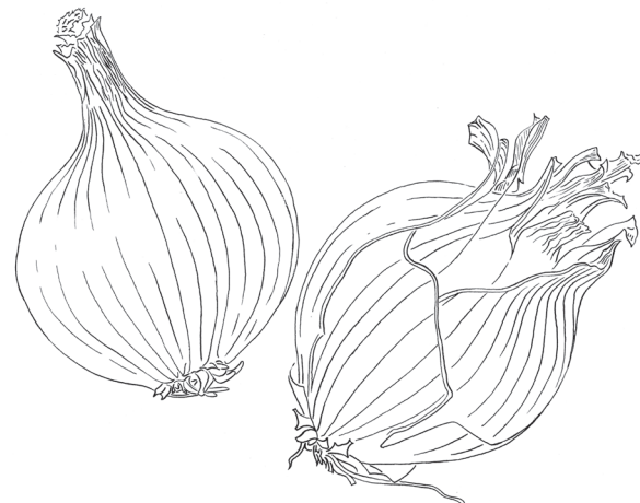
Onions' dry, papery outer layers protect the bulbs' succulent inner layers from drying and damage. Illustration by Megan O'Dea