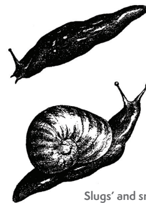
Slugs' and snails' large, fleshy "foot," used for locomotion, secretes a mucus or slime trail on which they glide.

Once you've identified potential hiding places, be consistent about cleaning them out. "Continue to search snail hiding places, daily if possible, until your catch becomes noticeably smaller," writes Pam Peirce in Golden Gate Gardening . "Then continue hunts of their favorite hiding places once a week. Don't stop handpicking; keep it as a part of your ongoing control program even if you use other methods as well. It's your most effective weapon." Combine daytime hunts with night-time searches, when slugs and snails come out to feed—but be aware that for every slug you catch, there are likely 20 more still hiding.