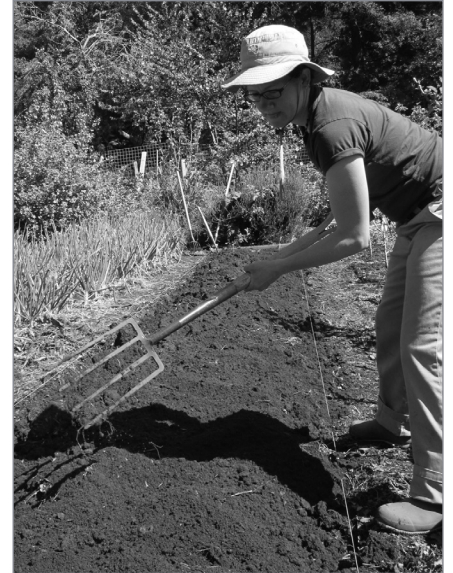
Using a tilting fork to incorporate compost into the top few inches of the soil and create a seed bed.

Organic matter is a major force in the formation and stabilization of granular or crumb structure of soil aggregates (think of a cross section of a loaf of freshly baked whole wheat bread as a visual analogy). When organic matter is added to a soil via cultivation, the plant residues cement or bind soil particles together as a result of gels, gums, and glues that are byproducts of decomposition. Mycelial strands or webs of fungi also bind soil particles together.